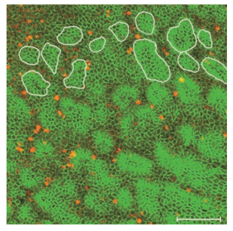
Fig. 3. Populational asymmetry in human epidermis. Epidermal whole mount stained for \beta 1 integrins (green). Stem cells are enriched in the clusters of cells with the highest integrin levels (some of which are delineated in white); these clusters are separated by actively proliferating (Ki67-positive nuclei in red), transit amplifying cells with lower integrin levels. Scale bar, 100 µm. [From U. B. Jensen et al. (5)]

In epidermis and intestinal epithelium, recent data highlight the importance of the Tcf/Lef family of transcription factors. Homozygous null Tcf4 mice lack stem cells in the small intestine, whereas Lefl homozygous mutants have defects in hair and whisker formation (8). β-Catenin activates Tcf/ Lef-mediated transcription and is more abundant in epidermal stem cells than in transit amplifying cells; overexpression of a stabilized form of the protein increases the proportion of stem cells in vitro, and in vivo it causes keratinocytes to revert to a pluripotent state in which they can differentiate into hair follicles or interfollicular epidermis, with some of the follicles going on to develop tumors (9). By contrast, overexpression of \beta -catenin in the intestinal epithelium of transgenic mice stimulates proliferation but there is no net increase in